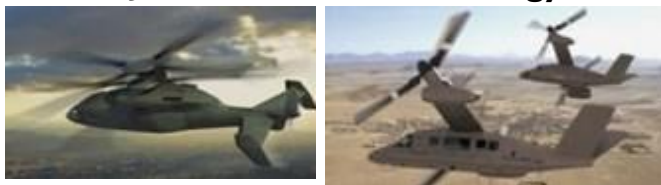
Air Vehicle Demonstration