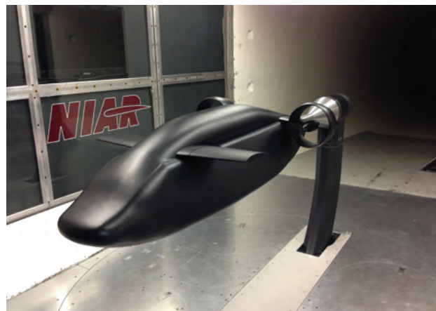
AVX conducted small-scale wind tunnel tests at the National Institute for Aviation Research (NIAR) at Wichita State University. A 1/10th-scale model will run in the low-speed tunnel at Texas A&M early in 2016 under the JMR contract with the Army.